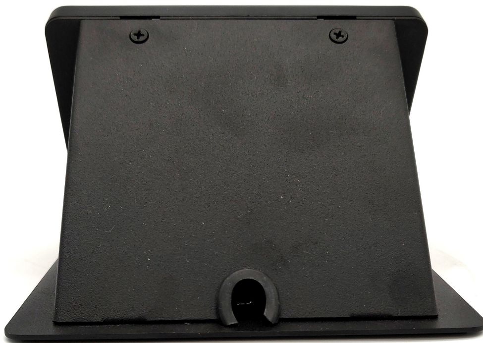
Back side of the T-5 Table Mount 2G-BM